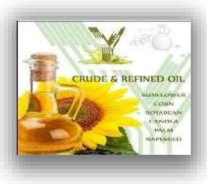
Sun Flower Oil